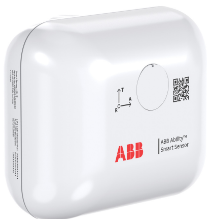
ABB Ability™ Smart Sensor for hazardous areas Installation with wedge mount

IMPORTANT! Read these instructions in their entirety before installing the ABB Ability™ Smart Sensor for hazardous areas with wedge mount.